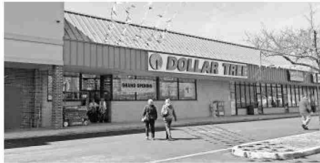
Dollar Tree celebrates its grand opening in Route 37 in Toms River.

Have you seen a construction project in Monmouth or Ocean counties and wanted to know what was going there? Contact staff writer Devin Loring at 732-643-4035 or dloring@gannettnj.com , and she will look into it for a future column. For previous stories, visit www.app.com/whatswhere .